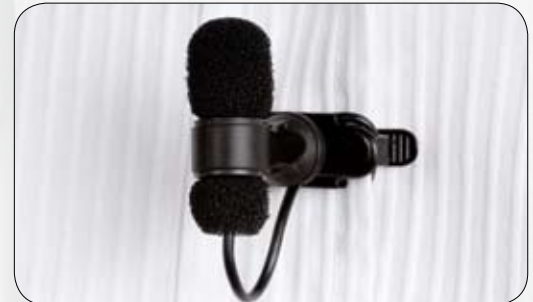
Fig. 8. 4080 mounted right