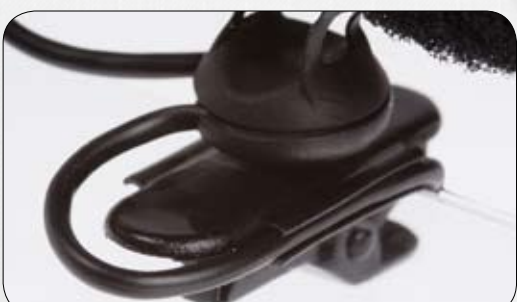
Fig. 4. Loop between holder and clip