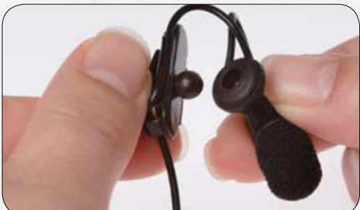
Fig. 2. 4080 mounting solution