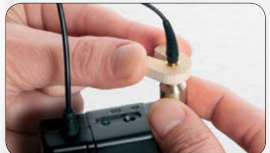
Fig. 9. Tightening the MicroDot connector