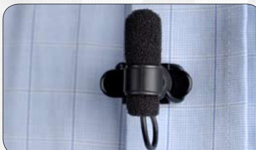
Fig. 7. 4080 mounted left