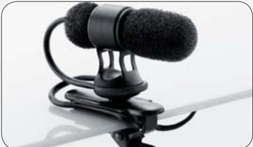
Fig. 1. 4080 Miniature Cardioid Microphone, Lavalier