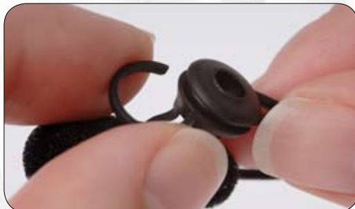
Fig. 5. Securing the cable with the cable clamp