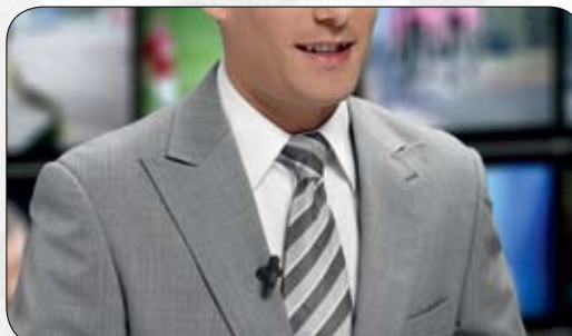
Fig. 6. Placement 20-25 cm (8 - 10 in) from mouth